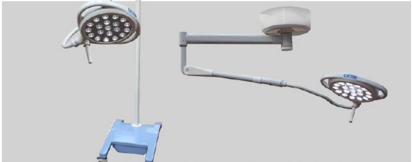
Portable LED examination light