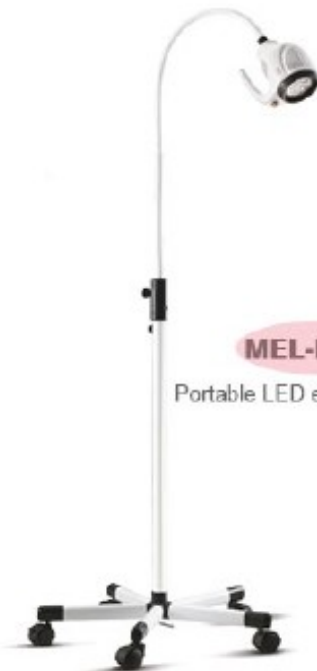
Portable LED examination light