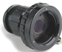
Alternative Design with 3-Petal Clamp