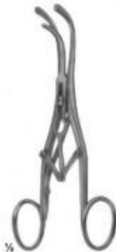
16-177 LABORDE 125 mm