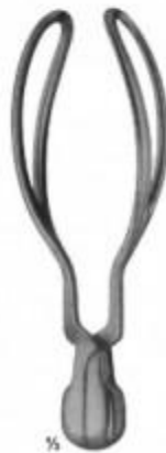
16-118 SIMPSON 235mm