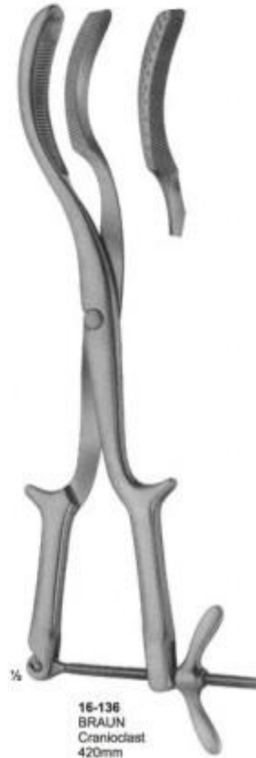
16-136 BRAUN Cranioclast 420mm