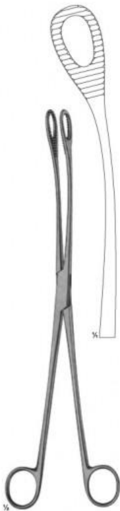
16-134 KELLY 320mm