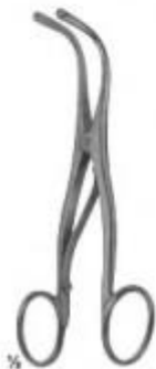
16-176 Trousseau 120 mm