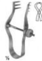
16-175 FINSEN 70 mm