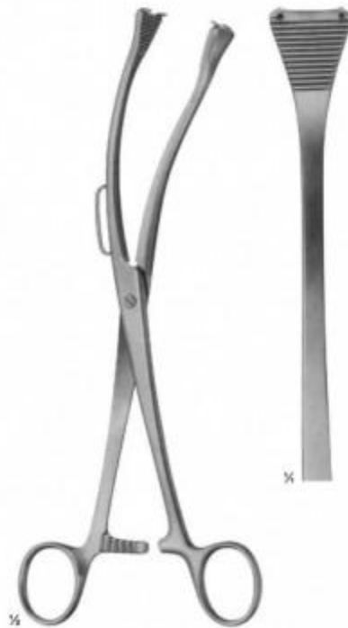
16-122 GAUSS Scalpel Flap forceps 260 mm