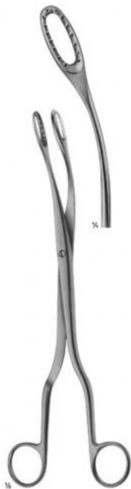
16-130 SAENGER 285 mm