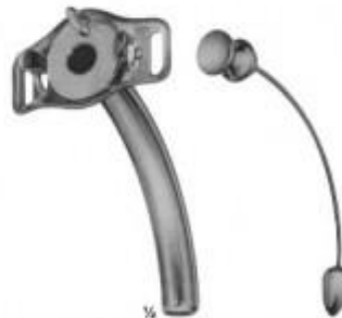
Diam. X length 16-149 Fig. 0= 4x50 mm 16-150 Fig. 1= 5x58 mm 16-151 Fig. 2= 6x58 mm 16-152 Fig. 3= 7x70 mm 16-153 Fig. 4= 8x78 mm 16-154 Fig. 5= 9x84 mm 16-155 Fig. 6= 10x84 mm 16-156 Fig. 7= 11x86 mm 16-157 Fig. 8= 12x88 mm 16-158 Fig. 9= 13x90 mm