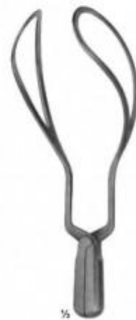
16-119 WRIGLEY 250 mm