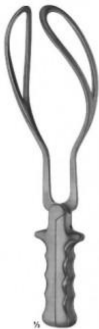
16-117 SIMPSON-BRAUN 305mm