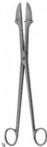
16-135 SMELLIE Perforator 270mm