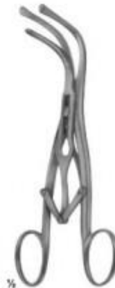
16-178 LABORDE strong pattern 135 mm