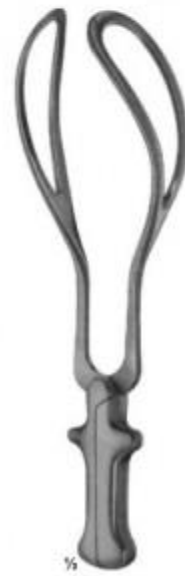
16-116 SIMPSON-BRAUN 305mm