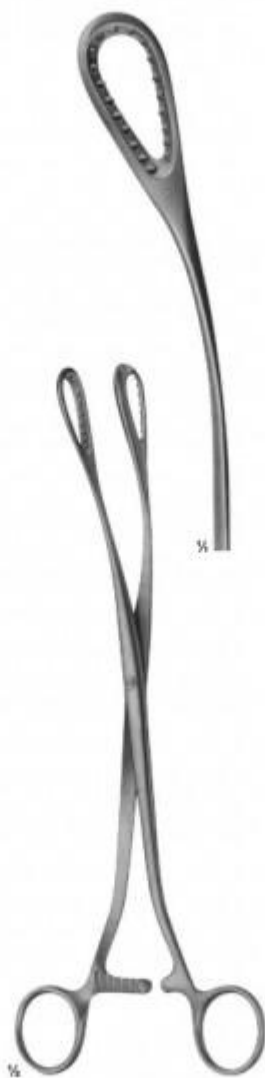
16-131 SAENGER 285 mm