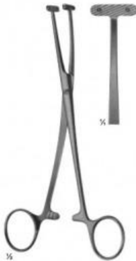
16-121 WILLETT Scalpel Flap forceps 185 mm