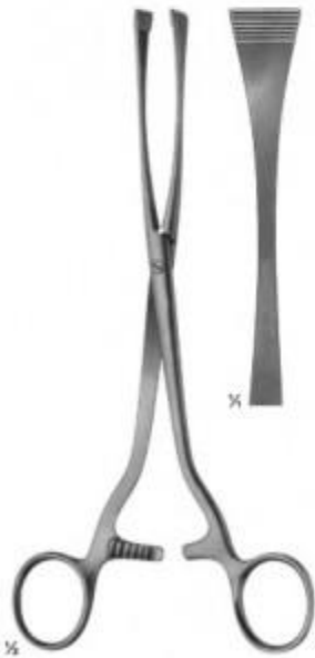
16-120 GREEN-ARMYTAGE Caesarean section haemostatic forceps, for edges of the transverse incision in the lower segment 220 mm