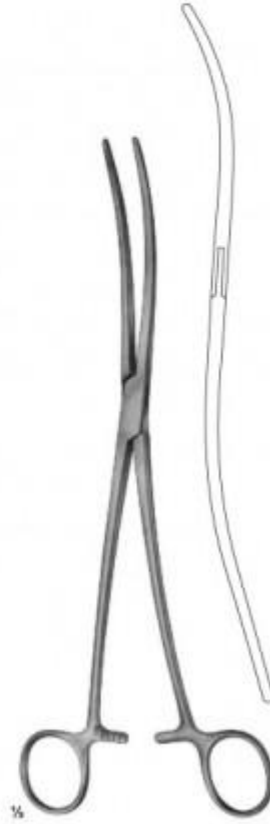
14-110 BOZEMANN 255 mm