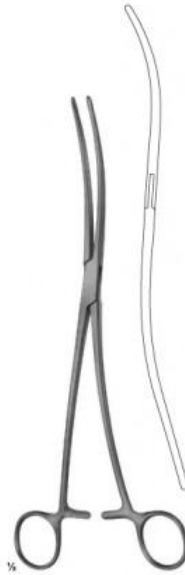
14-109 BOZEMANN 250 mm