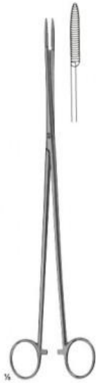
14-107 PELKMANN 260 mm