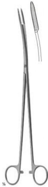
14-108 PELKMANN 260 mm